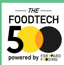
Food Tech 500