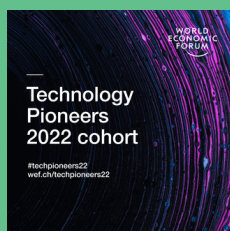
World Economic Forum Technology Pioneers 2022